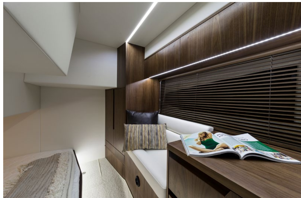
The second cabin with a double bed offers plenty of space —