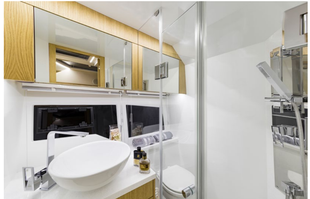
A closed-off shower will help to keep the bathroom dry and tidy —