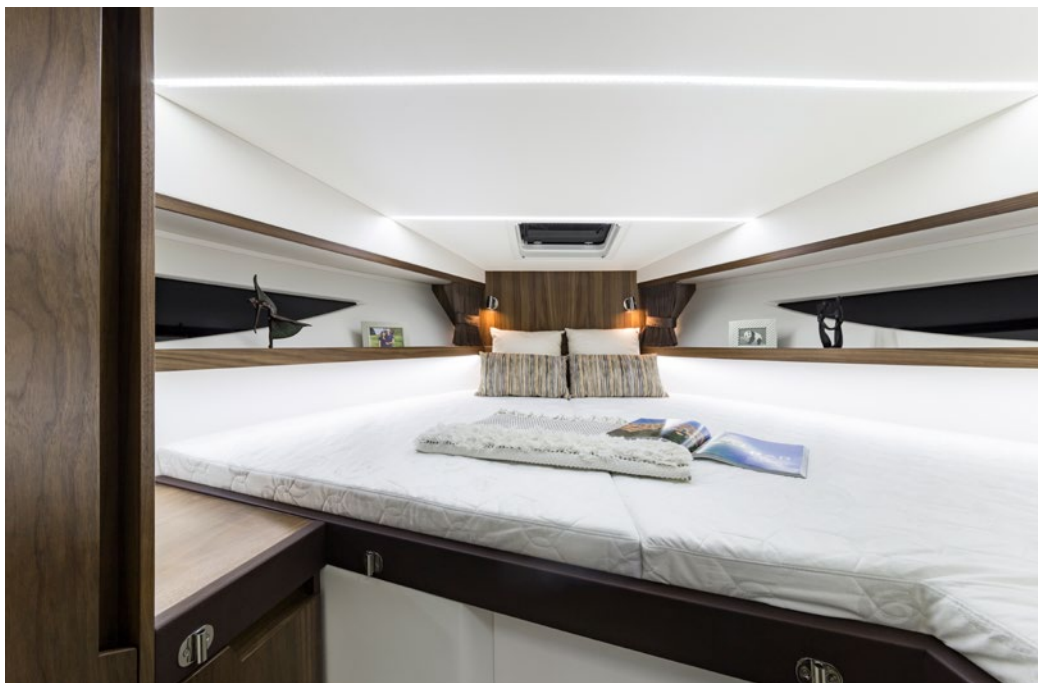
The forward cabin will sleep two with extra space for storage —