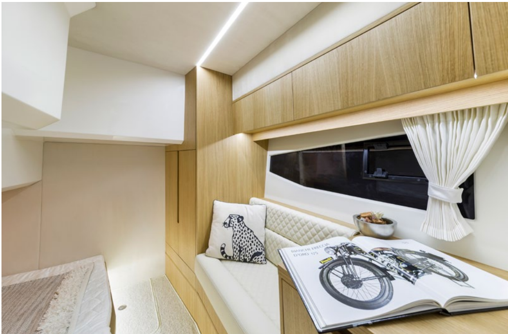
The guest cabin has a large double bed and holds extra storage —