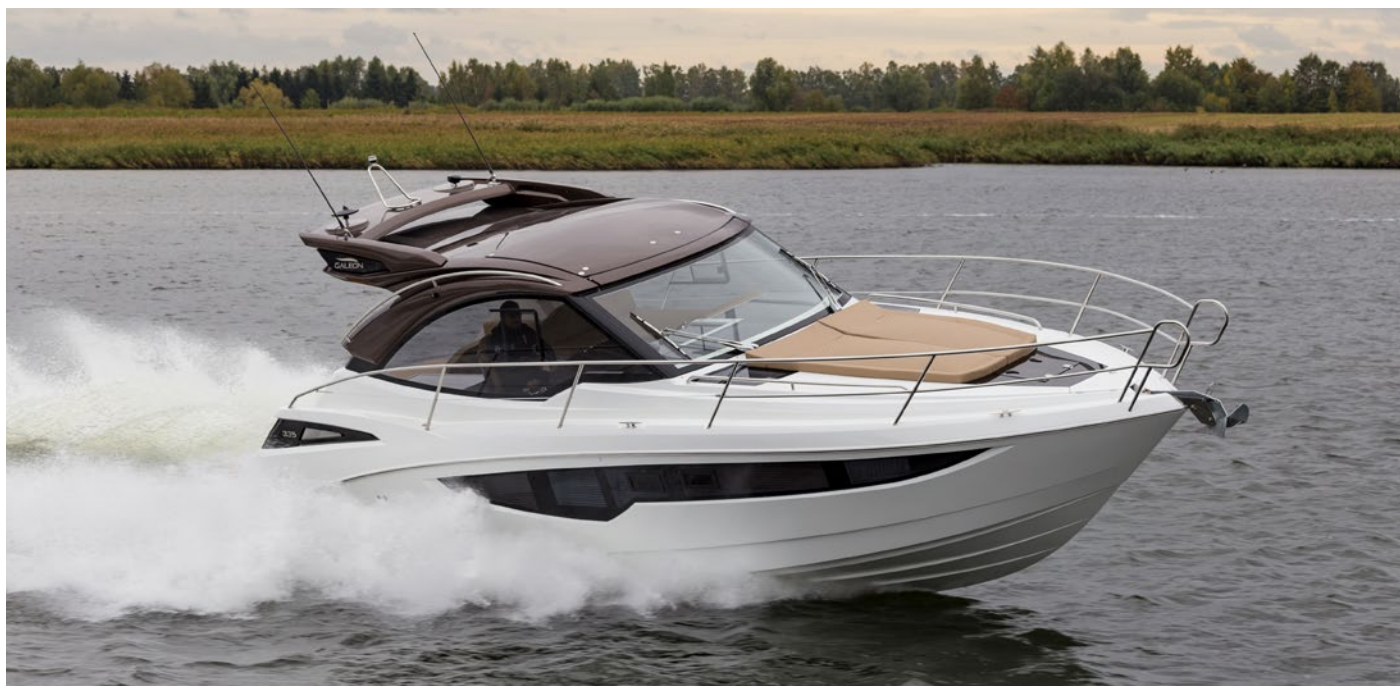
Striking design and smooth cruising of the 335 HTS

A new addition to the Galeon cruiser line-up offers great handling and sport-like performance in any conditions