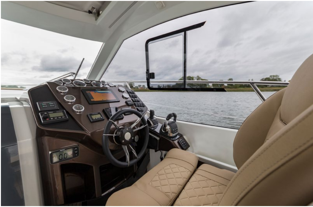
— Precise handling and great visibility from the helm