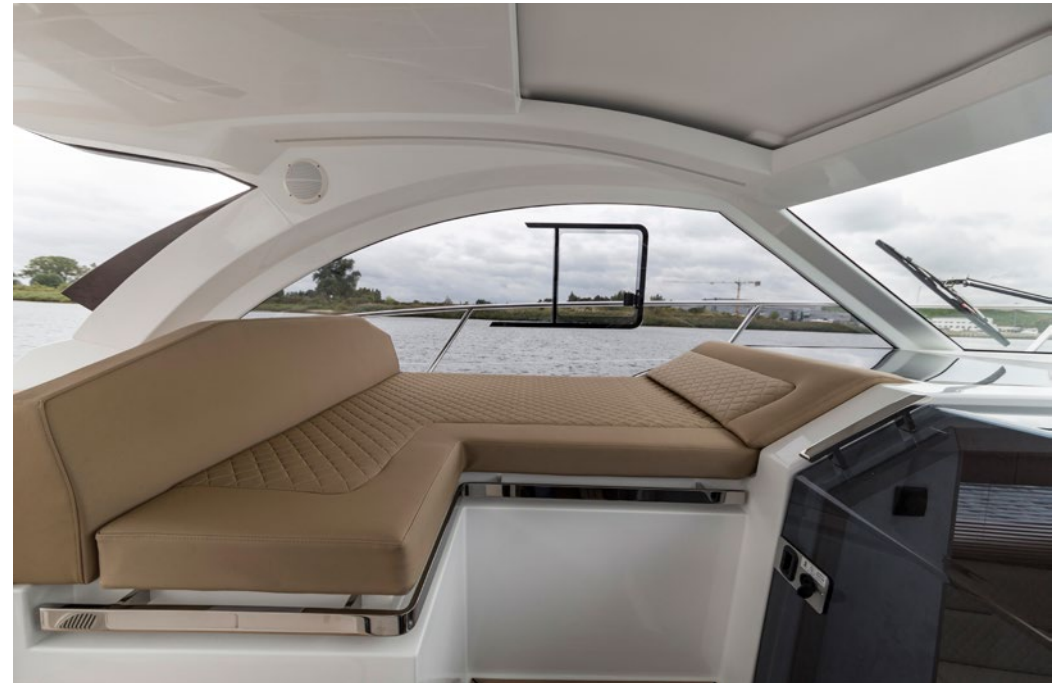
— Extra passenger space up front