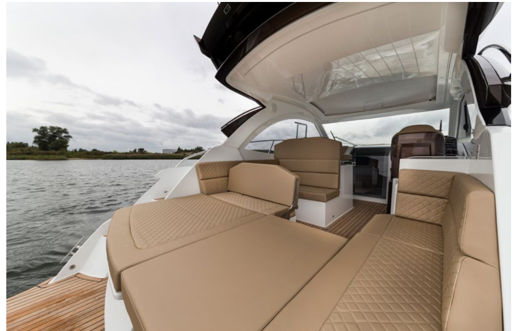
— Use the extra mattress to create a large sundeck facing the aft