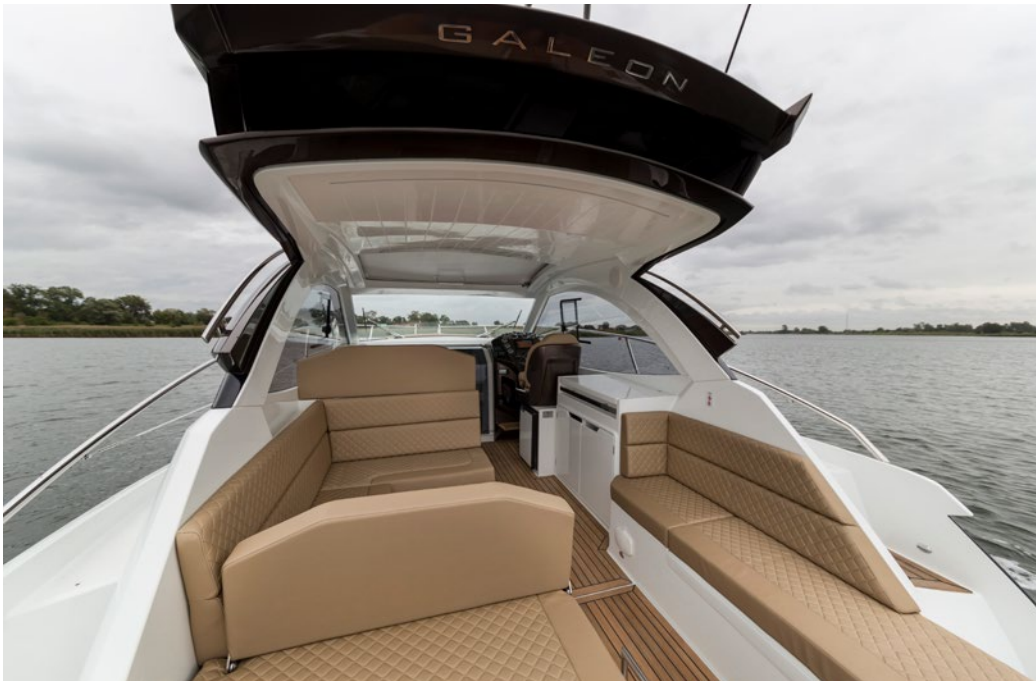
— Plenty of space for fun and relaxation on board of the 335 HTS