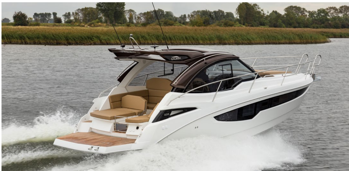
Notice the large bath platform for water based activities