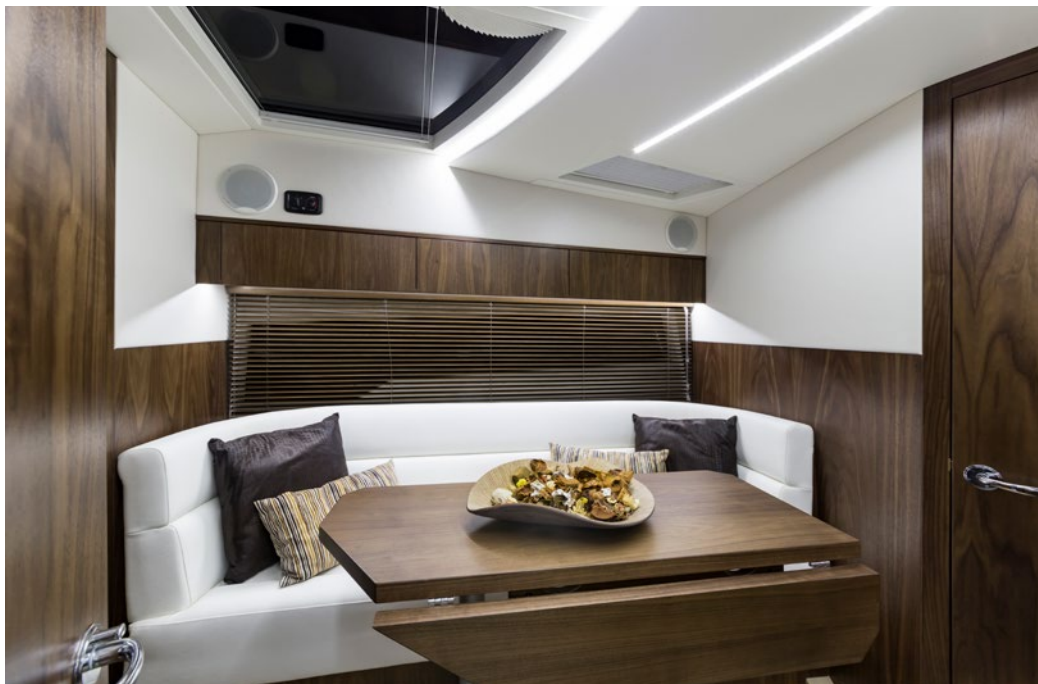
The dining and rest area down below —