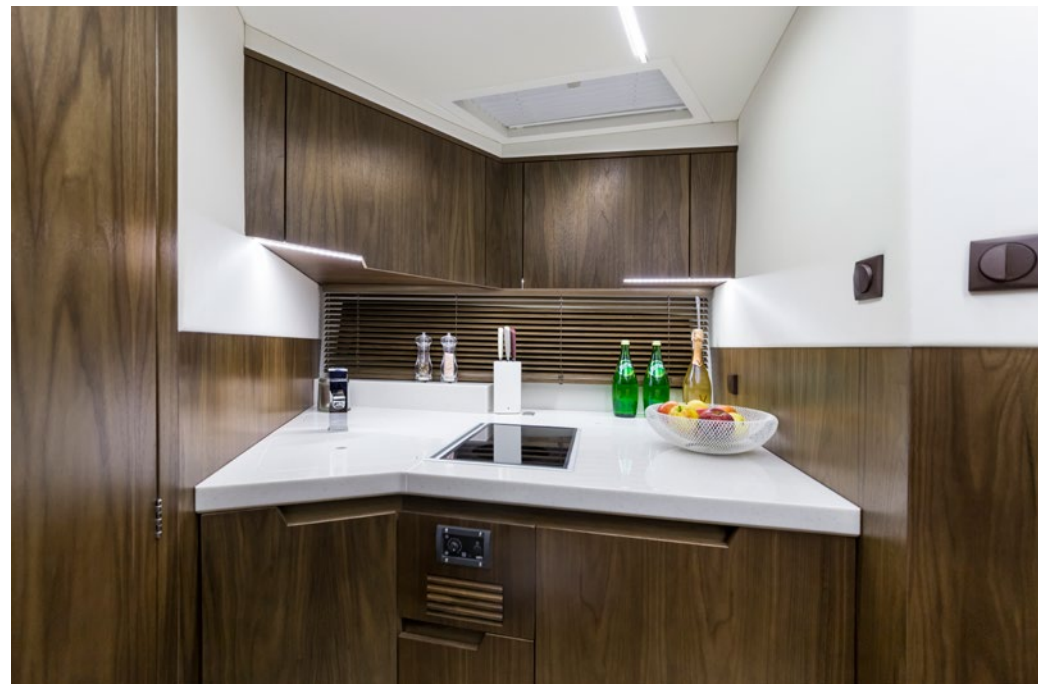
A well equipped galley area —