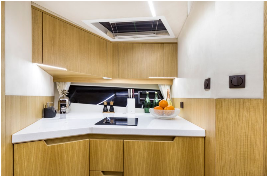
The forward cabin will sleep two —