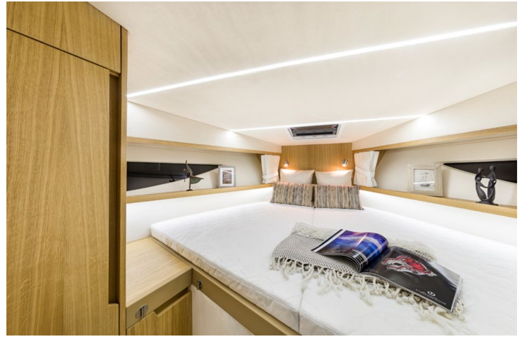
The galley area will hold plenty of supplies —